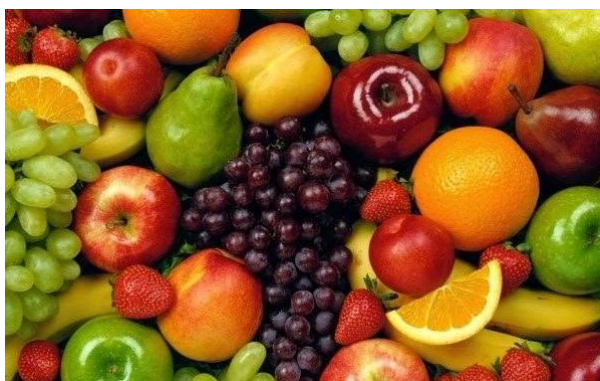
8 - Healthy diets and dietary needs and choices